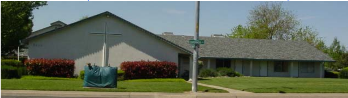
First Baptist Church of Rocklin and Site of Sierra Music Academy

We hope everyone enjoys the spacious classrooms and convenient location of our new school. For a map and directions of our new school site, please see the map on page 4.